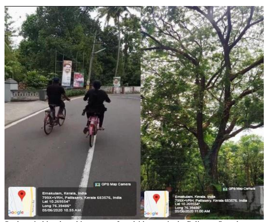
Students in bicycles taking count of roadside trees in the Palissery Stretch

The NSS volunteers of SCMS School of engineering and technology jointly conducted a tree walk to conserve trees on the roadside, prone to deforestation and other man-made practices. An enthusiastic bunch of volunteers started their journey from our college (palissery) to koratty covering 6kms approximately in cycles. While on their way students identified the trees, their biological name, and species assigned to them, and took a count of the trees needed to be protected. Each of those trees will be provided with a nameplate and QR code assigned to them which will be covered in phase 2 of the session that is needed to be conducted.