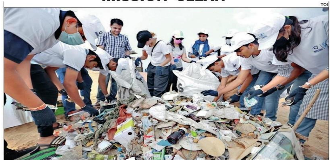
NSS volunteers from Marampally MES College, SCMS College of Management, SCMS College of Architecture and SCMS College of Engineering participate in the cleaning drive organized by the Kerala Hotel and Restaurant Association, Food Delivery App Resoy and Stenum Asia at Puthuvype beach on Thursday