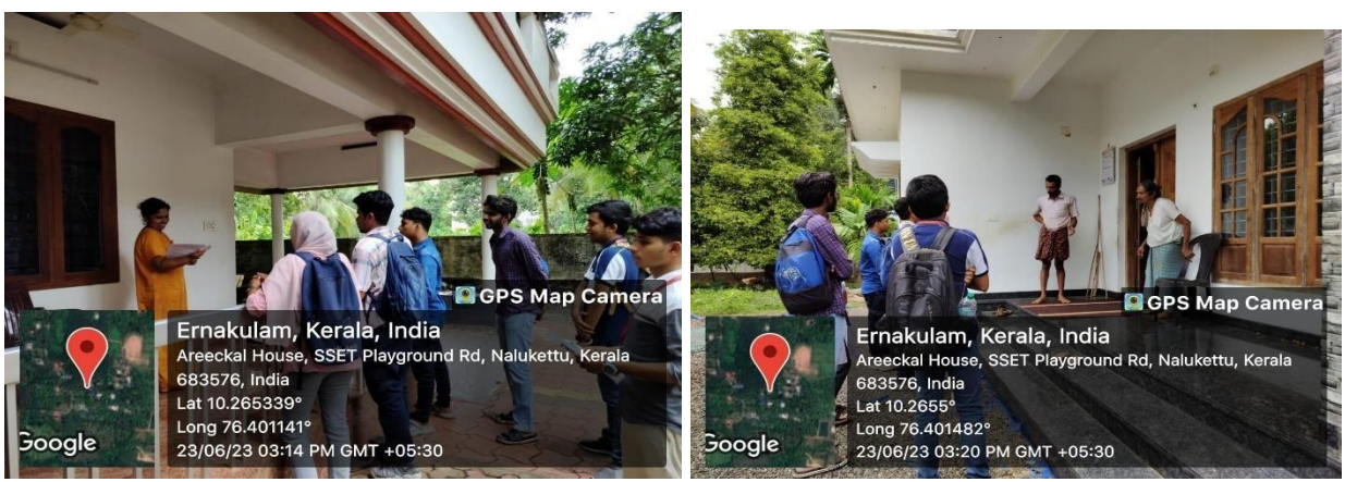
SSET Students involved in Energy audit at Nalukettu Village