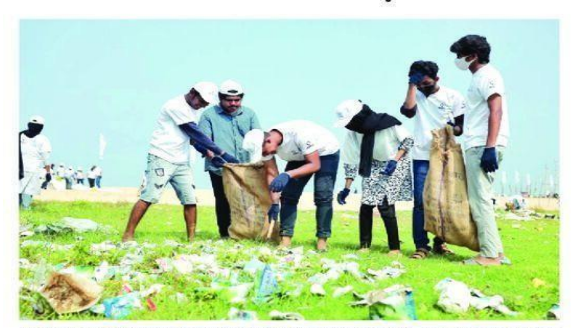
കേരളാ ഹോട്ടൽ ആന്റ് റെസ്റ്റോറന്റ് അസോസിയേഷൻ, റെസോയ്, സ്റ്റെനം ഏഷ്യ എന്നിവരുടെ ആഭിമുഖ്യത്തിൽ പുഇവൈപ്പ് ബീച്ചിൽ ശുചീകരണ പ്രവർത്തനം നടത്തുന്നു.

Paper snap of the Students collecting paper and plastic waste from the Puthuvype Beach.