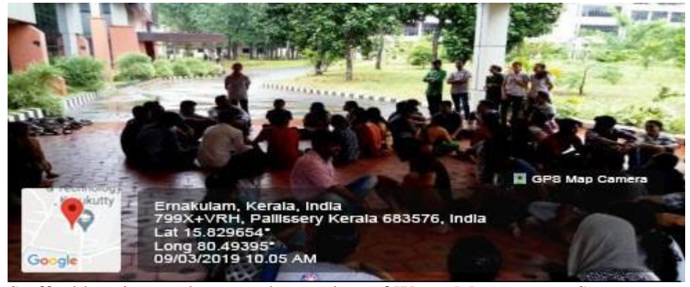
Staff addressing students on the conduct of Waste Management Survey

The NSS volunteers of SCMS School of Engineering and Technology conducted a waste management survey at Karukutty Panchayat. The survey was done for four days. The main aim of the survey was to know whether the waste management is proper in the area. Volunteers also suggested proper and new waste management techniques. It was a good experience for volunteers as they were also able to know more proper methods of waste management and how it has to be done.