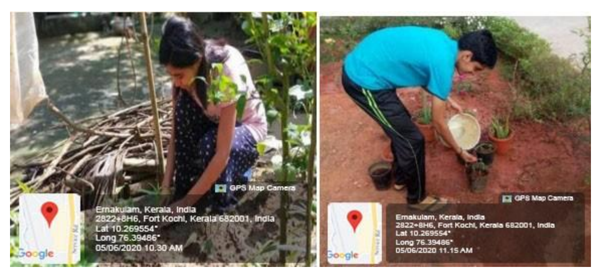
Students planting tree saplings at their homes during the Covid pandemic

Planting a sapling program on behalf of the environmental day celebration was conducted on 5th June 2020 . Due to the current pandemic situation, NSS volunteers actively participated by planting a sapling at their respective houses, and photographs of the same were also submitted.