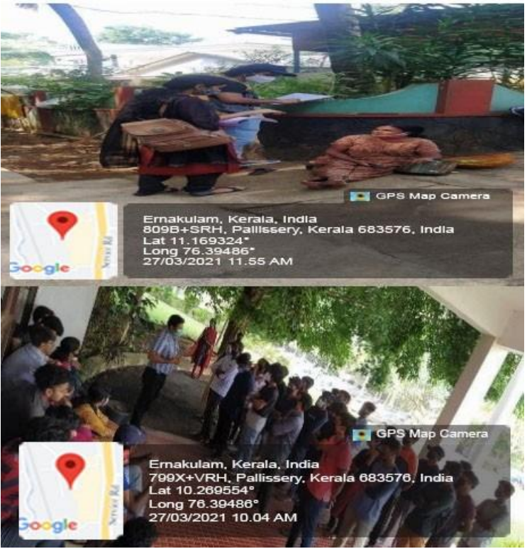
Student Volunteers collecting data from nearby homes, Faculty giving guidance to students regarding data collection

During this time of the covid outbreak, strictly following the covid protocol, NSS volunteers of SSET conducted a survey covering houses under koratty panchayat. Volunteers were divided into groups by our volunteer secretaries, led by an executive panel member and each group was assigned a particular area for the survey. Volunteers were handed over the UBA baseline household survey forms having questions covering the water supply, waste management, inquiries regarding the pension received if any, and so on. Each of these questions in the said form was filled by our volunteers and was collected by our programme officers.