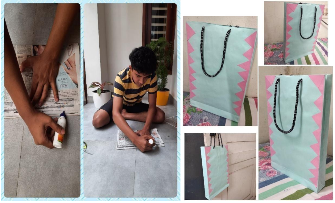
Students Preparing Paper Bags and samples of paper bags made.