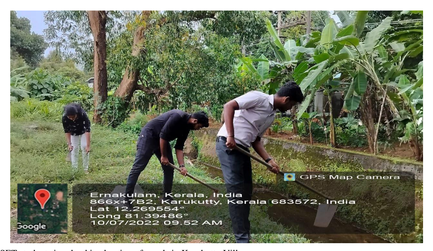
SSET students involved in cleaning of canals in Karukutty Village