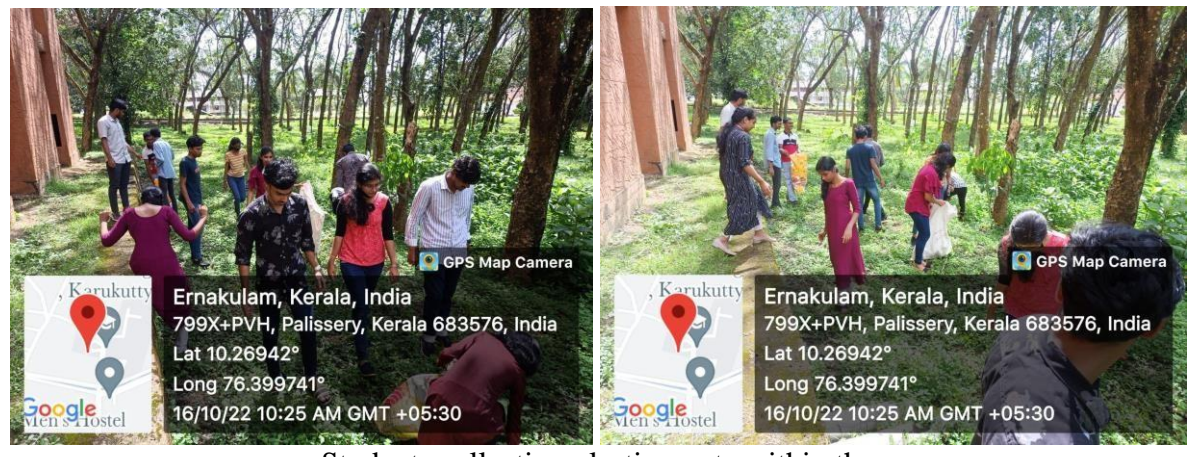
Students collecting plastic waste within the campus

Love plastic was an initiative by the NSS units of SSET targeted to clean the campus from plastic materials. On 16 th of October 2022, the volunteers gathered at the campus at 9 am and the programme was officially begun with the presence of programme officers. Volunteers were divided into 4 groups and each group was assigned a particular area of the campus from where the plastic was meant to be collected. Volunteer group along with the supervision of group leaders and volunteer secretaries removed the plastic materials from the campus. After collecting the plastic materials an evaluation was done to sort outthe sources of the plastic materials and discussed necessary actions to avoid such practices. A brainstorming was done among volunteers to reduce the presence of plastic materials in the campus. The collected plastic materials were properly disposed of.